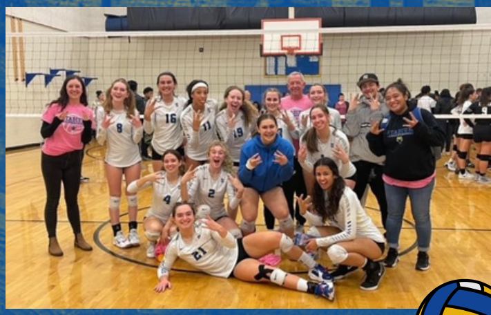
Stadium Tigers Volleyball Team beats Lincoln!